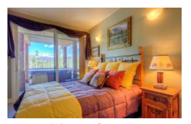
Master Suite 2