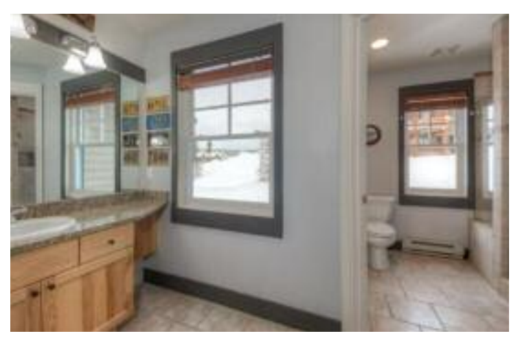
Master Suite 1 Bath