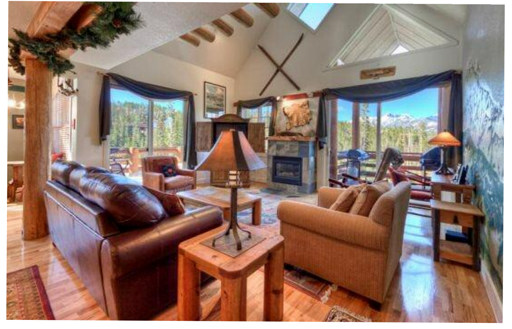
Offer: Seven nights valued at $2,660 Includes: cleaning/service fees Not included: Activities/club

Website: www.saddleridgerentals.com Property M5