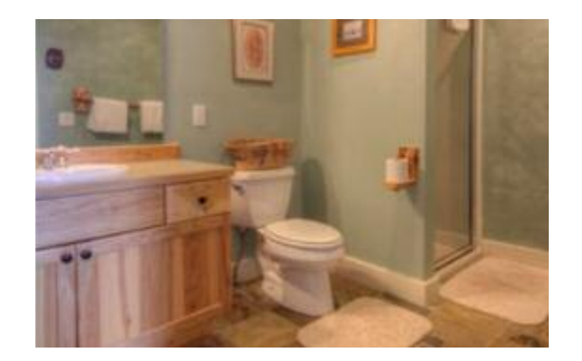
Master Suite 2 Bath

No pets or smoking. Must be used within one year.