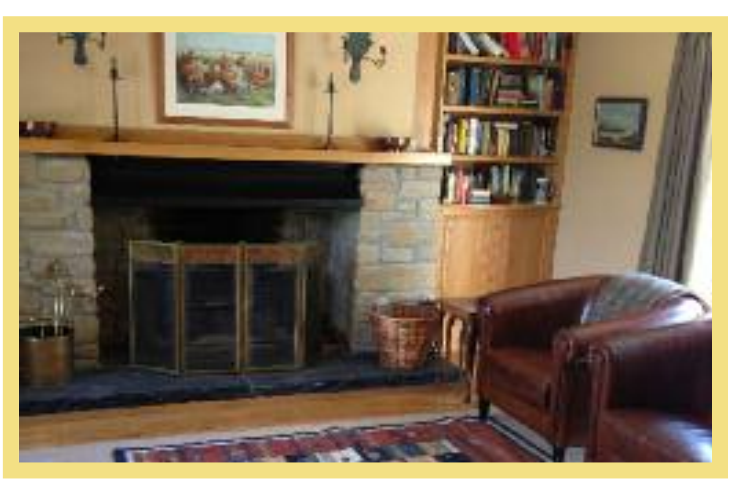
Sitting room with fireplace