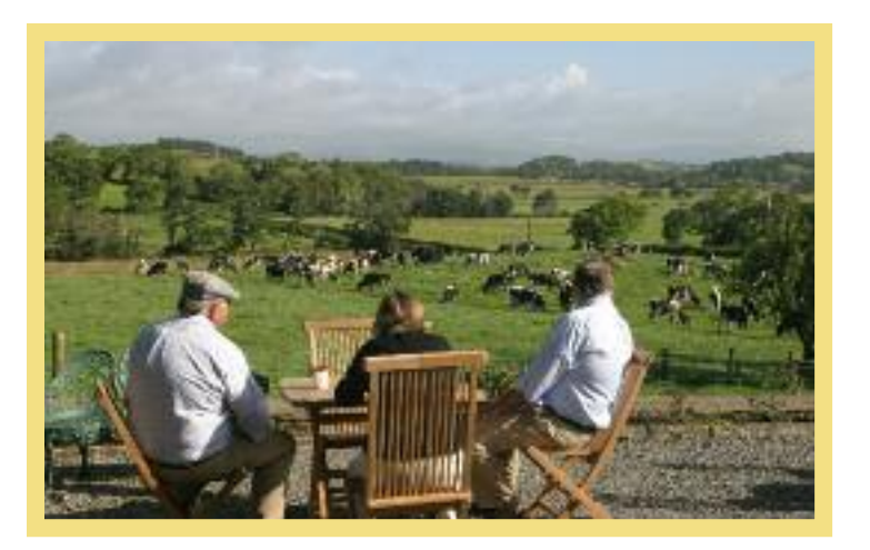
Seating area with view