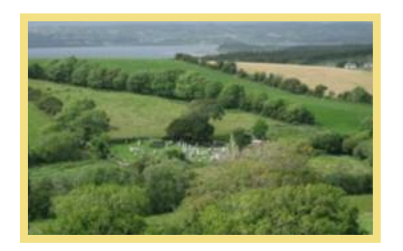
View to Donegal Bay