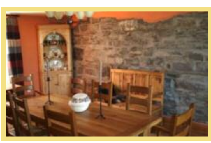
Dining room with fireplace