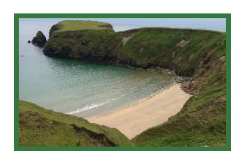
Silver Strand at Malinmore