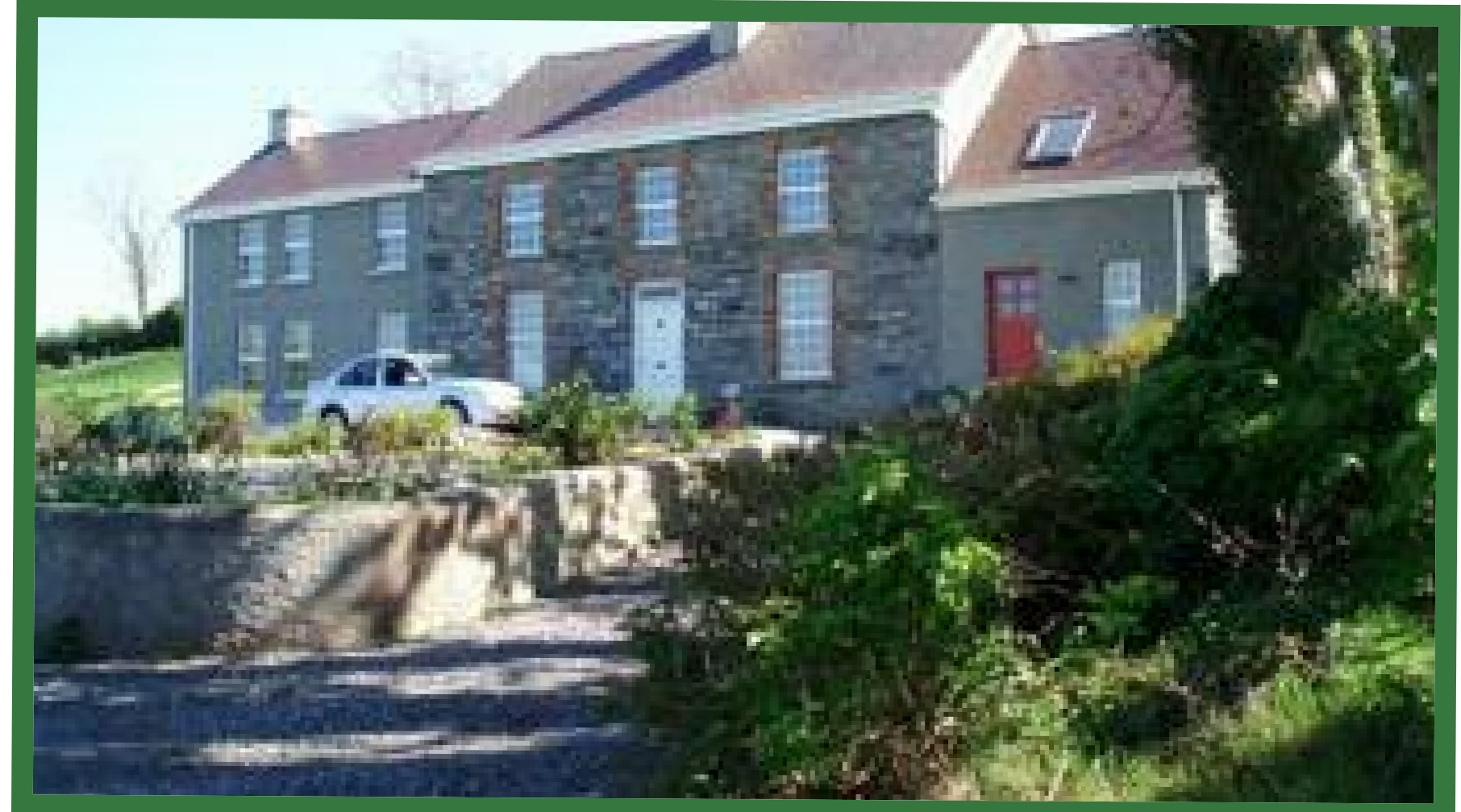
Offer: Seven nights valued at $1,722

Not included: cleaning/service fee of $500 plus $1,000 security deposit