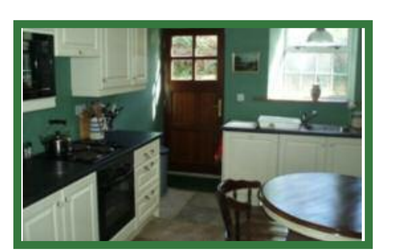
Fully equipped kitchen